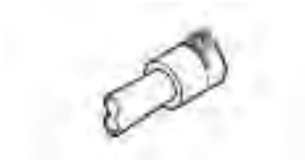
Preheating nozzle medium for WELDPLAST