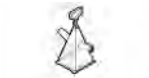
Welding rod de-reeler, Hand extruder