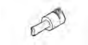
Preheating nozzle small for WELDPLAST