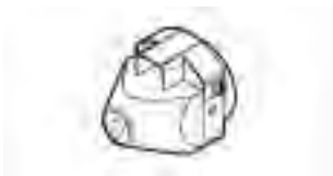
Welding shoe complete, corner, long ø 14 mm

129.008 - Welding shoe complete, corner, short ø 20 mm