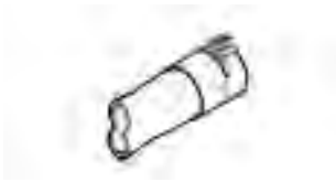
Preheating nozzle large for WELDPLAST