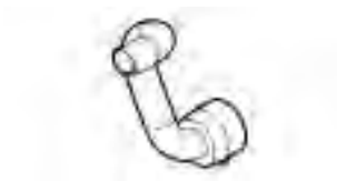
Hot air guide on top WELDPLAST 6

119.217 - Welding shoes blank complete 50 x 40 x 38 mm