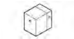
Welding shou blank 50x40x38mm for WELDPLAST

119.217 - Welding shoes blank complete 50 x 40 x 38 mm