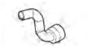
Heissluftführung seitlich WELDPLAST 6