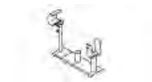
Tool rest for WELDPLAST and FUSION